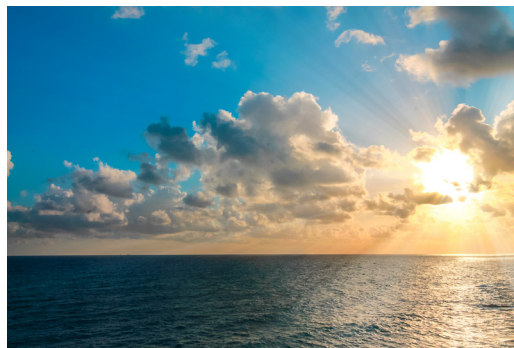
Clouds form in the atmosphere.

The oceans contain most of the water on Earth. And oceans are home to many different kinds of ecosystems. These ecosystems show the connection between the biosphere and the hydrosphere. For example, coral reefs cover a tiny section of the ocean. But they provide a habitat for many different species. Coral reefs are home to nearly 25% of all marine animals. These organisms are an important food source for others, including humans. Fish that live in coral reefs help to feed more than a billion people around the world.