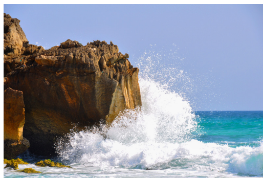
Ocean waves shape a coastline.